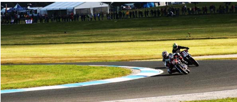
Beaton leading Phillis