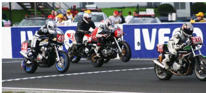
Race 2 Start